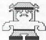
GERONIMO Tomahawk Technique